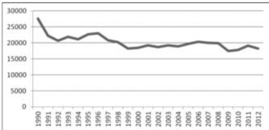
Fig. 1. Dynamics of the internal gross energy consumption for the period 1990–2012 measured in thousand tons of oil equivalent

Except for the simple visual tracing of the trends of development, statistical methods such as hypothesis testing can be applied in the energy field. Different tests are known in theory that help finding out whether a trend of development 4 is available for a given dynamic row. Autocorrelation coefficients of first order 5 (Dimitrov, 2005; Mishev and Goev 2010) are among the most commonly used tests. It is considered that when dynamic rows contain a trend of development they are